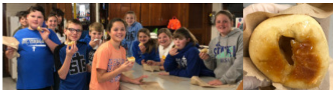
7th Grade Students made Easter Cookies!

Please contact the school office 618-783-3517 to learn more about these opportunities and for information.