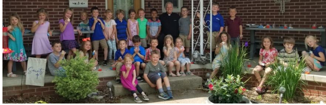
He provided them with a snack and drink.

St. Thomas Gigantic Garage Sale a GIGANTIC success! We are thankful for another awesome Garage Sale . We profited $11,369.00! Great job committee and those who helped in any way!